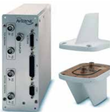
TAS605 computer and antennas

The TAS605 is a dual antenna traffic advisory system, designed to enhance traffic awareness for pilots of mid-performance aircraft by providing visual and audible cues.