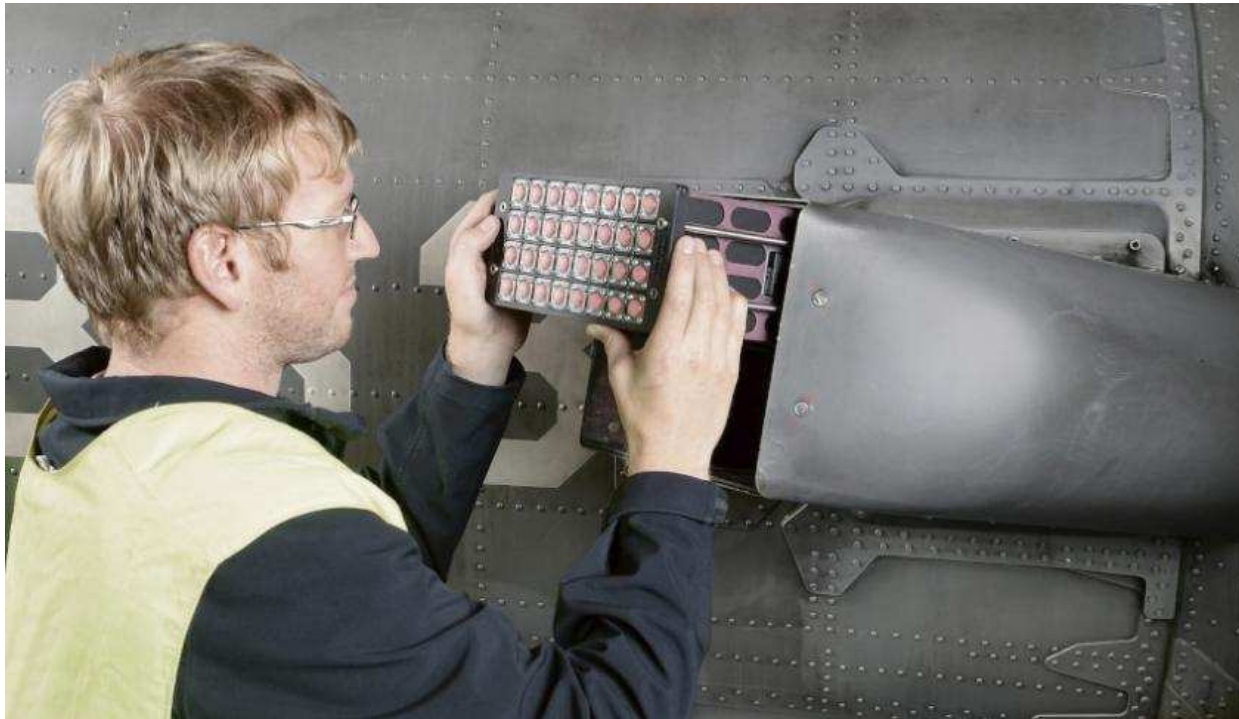
RUAG CAST-easy chaff and flare test equipment

AIR & SEA LIFT | 13 MARCH 2017 | STAFF WRITER