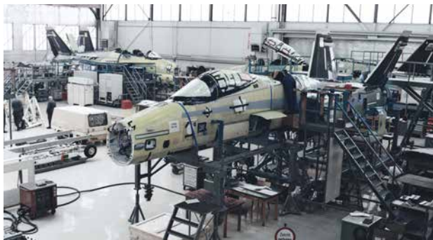
Final assembly of the F/A-18, F-5, Super Puma, EC-635 Full build-up of maintenance and upgrade capabilities prior to aircraft delivery