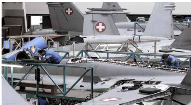
F/A-18 upgrade programs Modernization of various instrumentation to ensure state-of-the-art system capabilities