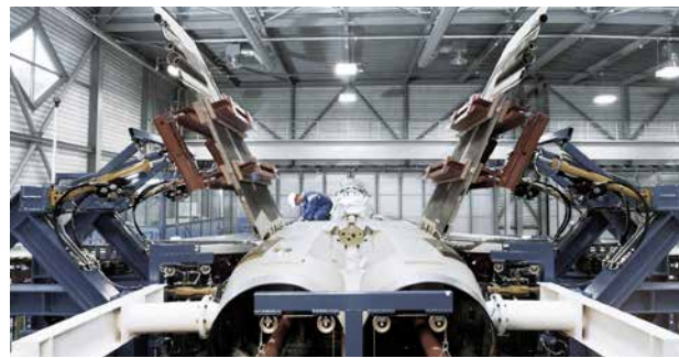
F/A-18 structural refurbishment programs Installation of more powerful and robust structural components to extend the platform's service life (from 5000 to 6000 flight hours)