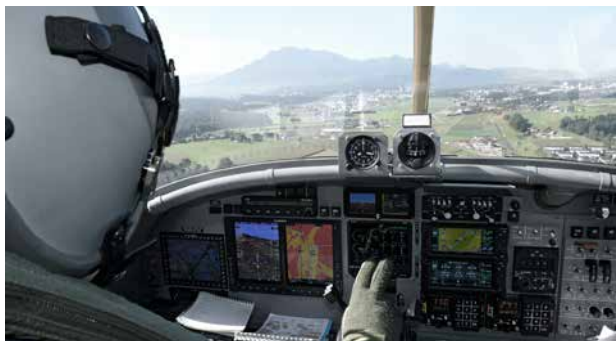
PC-6 upgrade (NCPC-6) Replacement of analog devices with electronic instrumentation and central displays