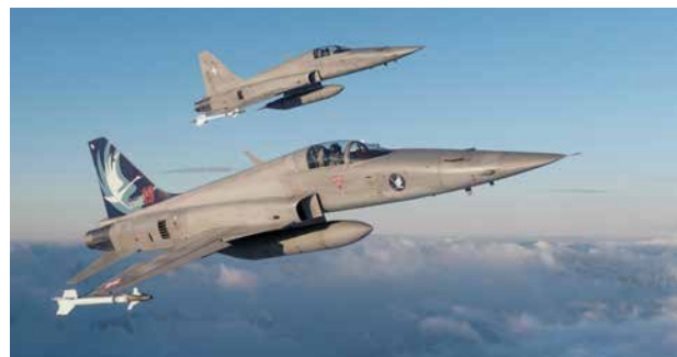
Operations extension program for F-5E/F to extend beyond scheduled decommissioning Additional personnel from the global business were called on at short notice to handle the large number of inspections required