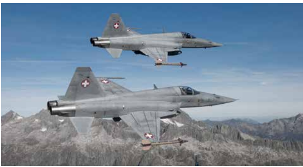
Upper Cockpit Longeron (UCL) exchange on the F-5 Replacement of highly stressed structural components enabled the fleet to continue operations