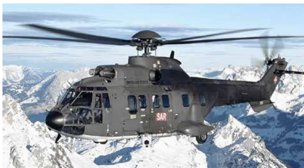
Replacement for FLIR Thermo-CAMs on the Super Puma Superior infrared camera upgrade greatly boosted performance