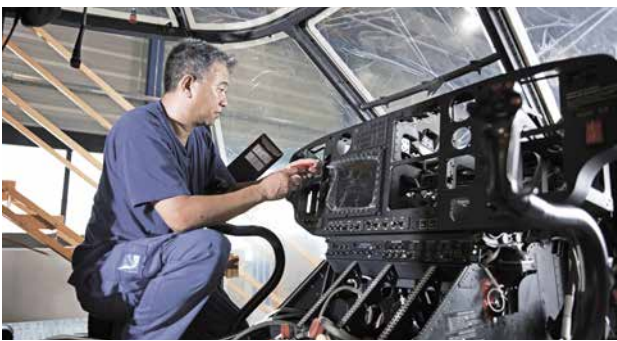
Super Puma/Cougar upgrade (WE89 & WE98) Modernization of various systems restores the Cougar TH98 to a good-as-new condition