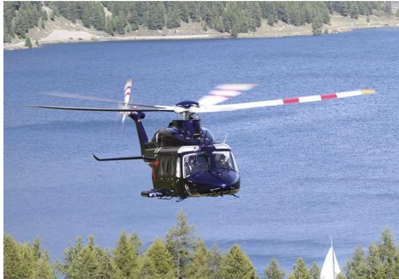
2015; 139; commercial; Swissjet; Switzerland; AW139, Agusta Westland, Leonardo Finmeccanica