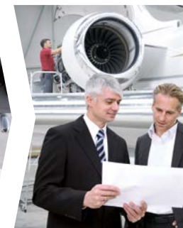
Support & Consulting