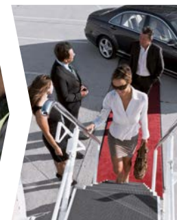
Fixed Base Operation